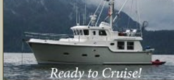
Ready to Cruise!