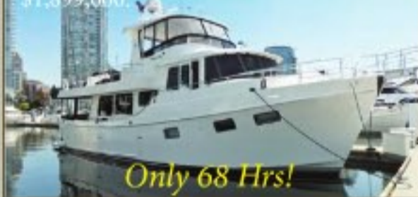
Only 68 Hrs!