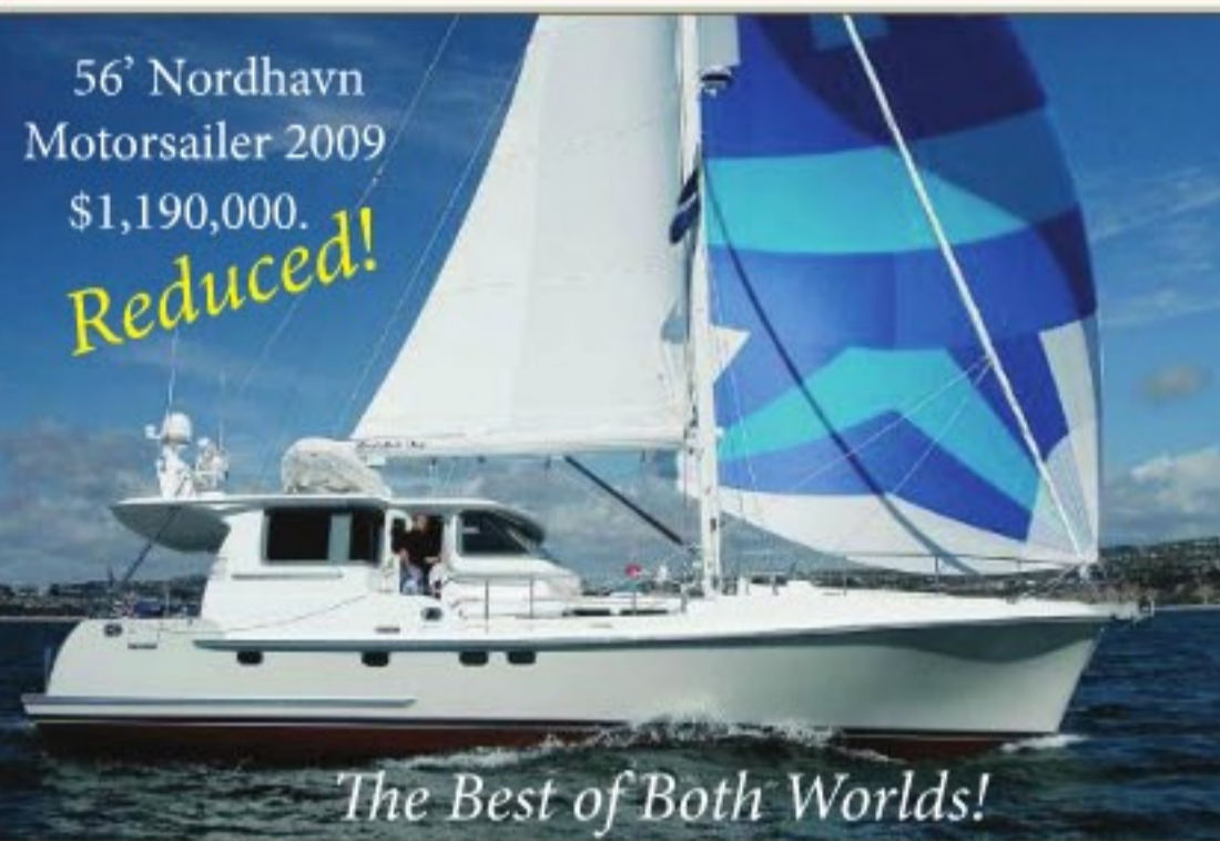
The Best of Both Worlds!

See Us To Make Your Boating Dreams Come True!