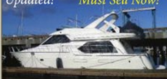
Updated! Must Sell Now!