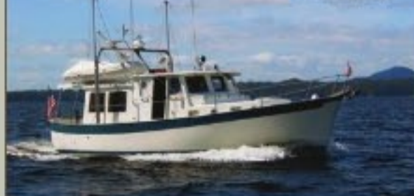
40' Willard Pilothouse 1984 "Quest" $149,999.