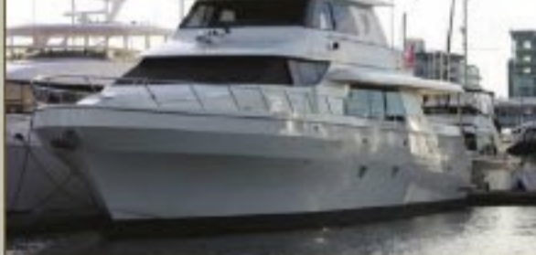
73' Wendon 2006 "Cru Zin 4 Daze" $1,490,000.